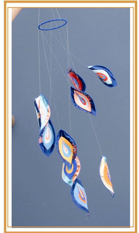
Mobile by Veronica