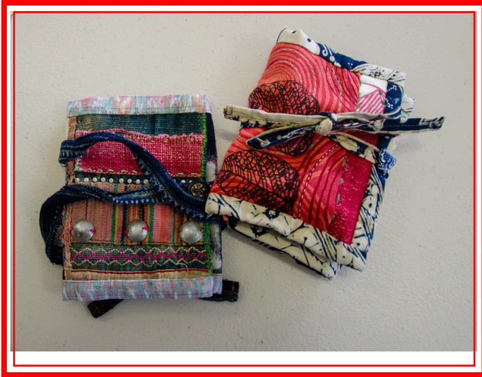
Hussif by Suzi